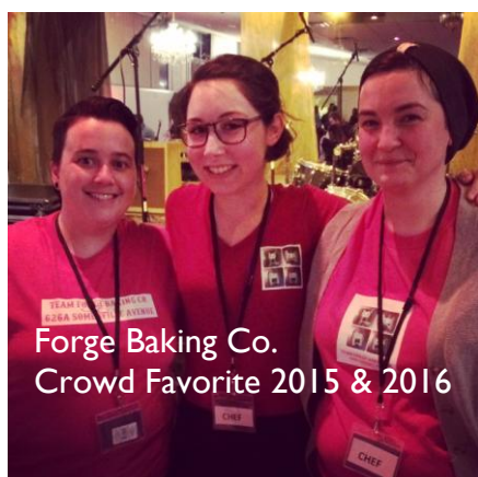
Forge Baking Co. Crowd Favorite 2015 & 2016

RESPOND is hosting its Third Annual Chili Cook-Off to raise funds for our life-saving Programs & Services. Local chefs compete to win the Chili Cook-Off trophy! Over 100 guests attended last year- this year will be even bigger. We hope you will join us and our celebrity guest judges for the fun!