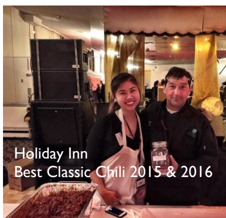
Holiday Inn Best Classic Chili 2015 & 2016